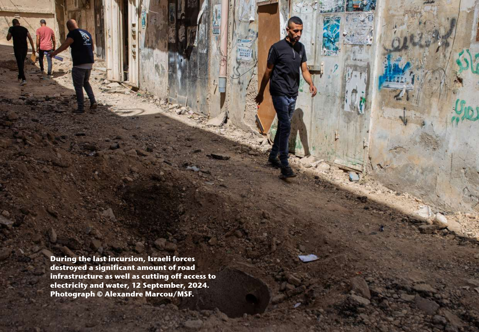
During the last incursion, Israeli forces destroyed a significant amount of road infrastructure as well as cutting off access to electricity and water, 12 September, 2024.