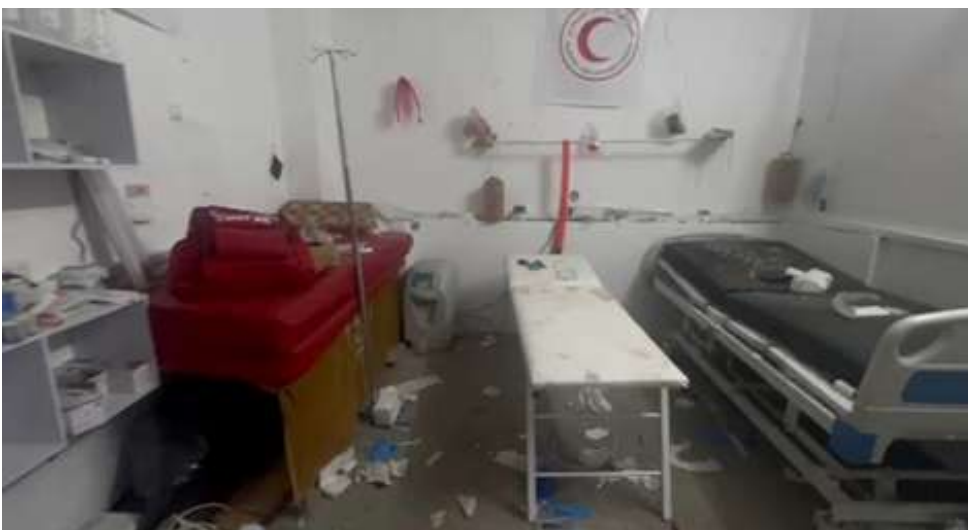
Damage done to the stabilisation point in Nur Shams camp, Tulkarem, following an Israeli incursion on 16-17 December 2023.