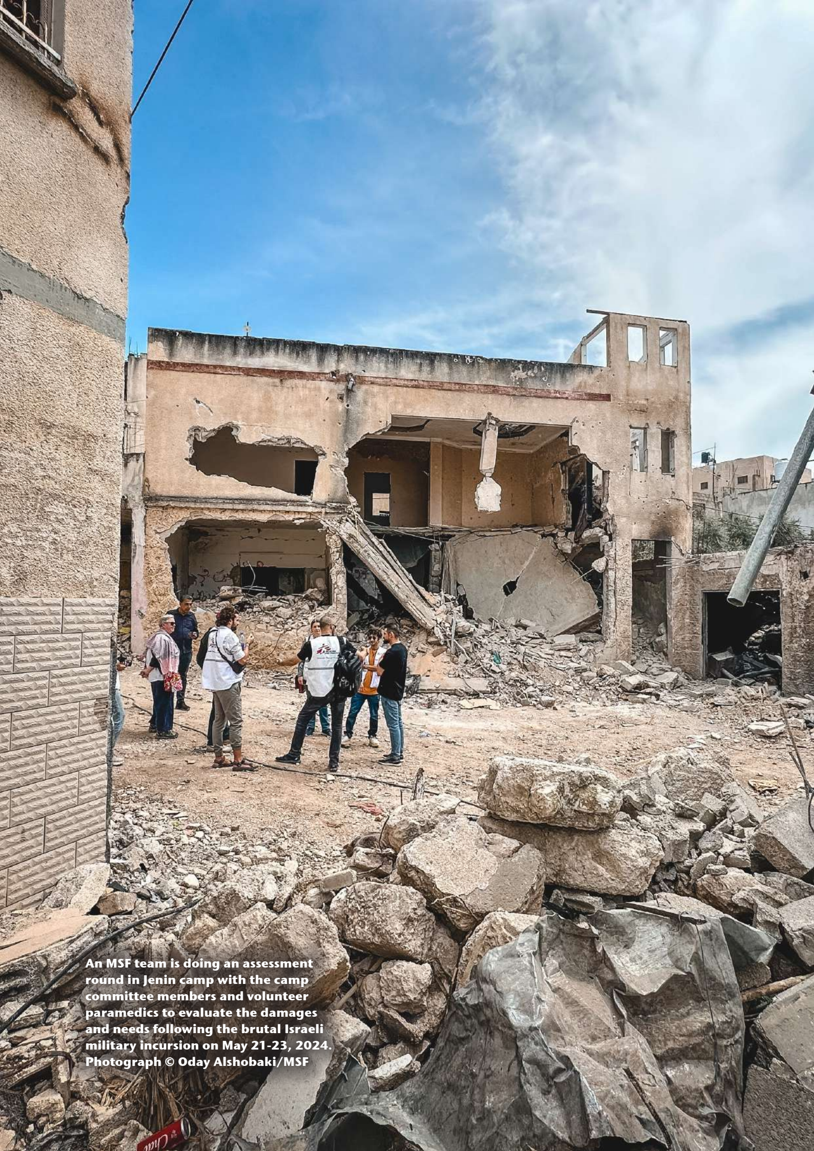
An MSF team is doing an assessment round in Jenin camp with the camp committee members and volunteer paramedics to evaluate the damages and needs following the brutal Israeli military incursion on May 21-23, 2024.