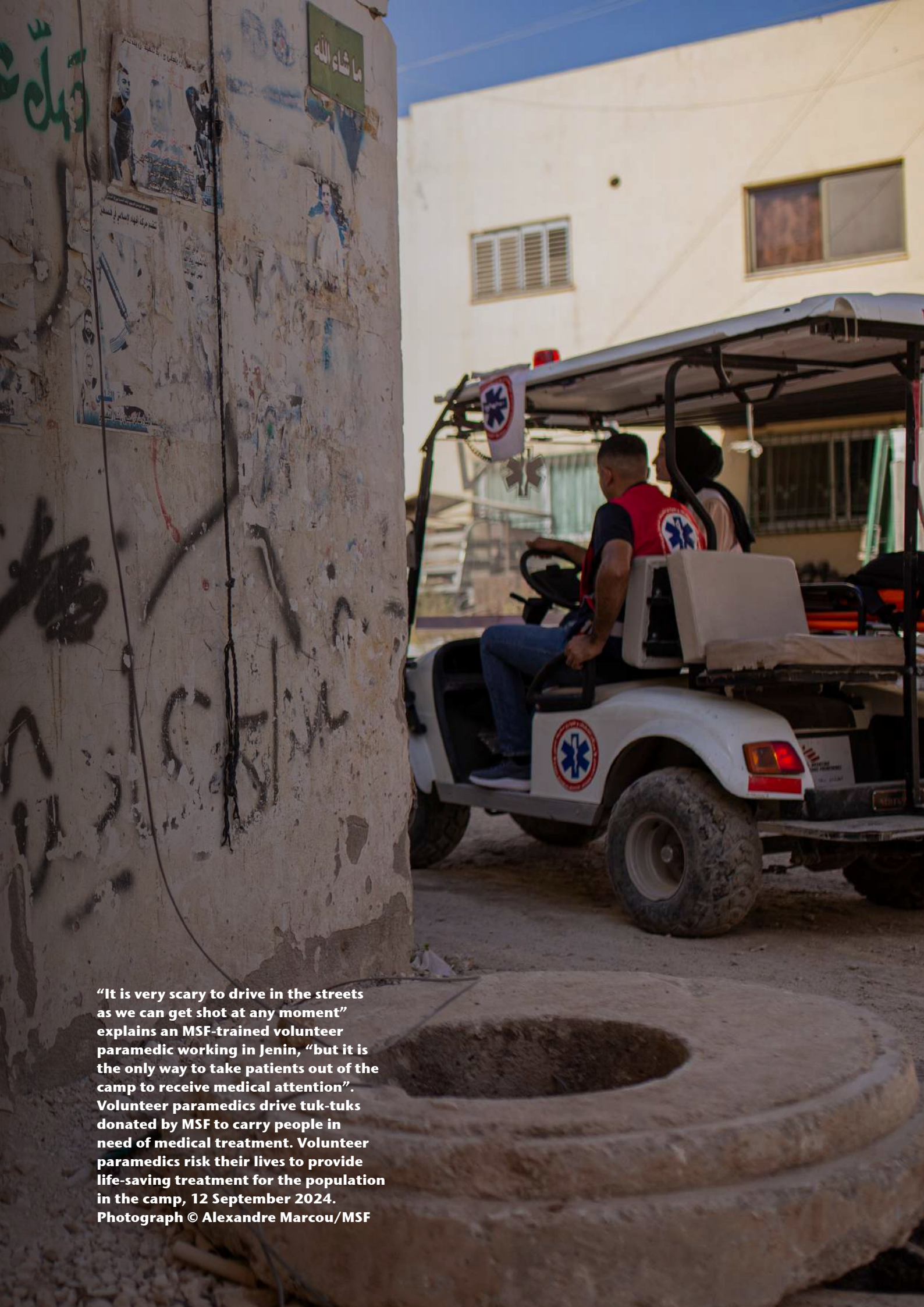
“It is very scary to drive in the streets as we can get shot at any moment” explains an MSF-trained volunteer paramedic working in Jenin, “but it is the only way to take patients out of the camp to receive medical attention”. Volunteer paramedics drive tuk-tuks donated by MSF to carry people in need of medical treatment. Volunteer paramedics risk their lives to provide life-saving treatment for the population in the camp, 12 September 2024.